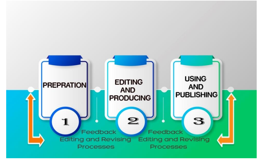
Figure (1) Amany Nabeeh El Mor's model of designing the static infographic

The model consists of three basic steps: preparation, Editing and producing then Using and Publishing. Each step is divided into sub-groups as follows: